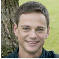
RIO 20-year-old, working full-time as a busser and dishwasher at the café