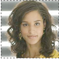
INDIGO 25-year-old university graduate with a well-paying salaried job